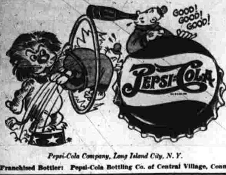
Pepsi-Cola Company, Long Island City, N. Y.